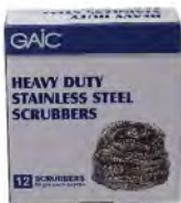
#93655 SCRUBBER STAINLESS 6/12/PC #82689 SCRUBBER STAINLESS 1/12/ 12ea/pk