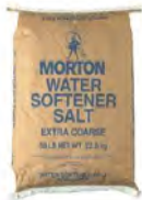
#94191 WATER SOFTENER SALT 49/50# F132130000G