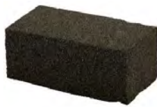
#93645 GRILL BRICK 12/20x10x9cm