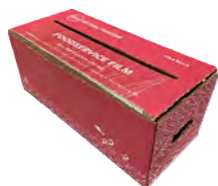
#80115 MTC FOOD SERVICE FILM 1/12"x2000