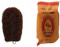
#93646 KAMENOKO TAWASHI LG 6/10 7x13cm