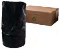
#90804 GARBAGE BAG#0951 55GAL 100/22x14x58"