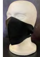
#81882 REUSABLE FACE MASK BLK 3pcs/PK M