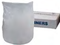
#92909 TRASH LINER 16 GAL (8M) 1000/24x33" FOP-CR2433H