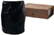
#91730-1 GARBAGE BAG #922 33 GAL 125/33x39" 1.5MIL BLK