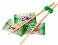
#90870 CHOPSTICK HOLDER 3/(500pc/BOX)