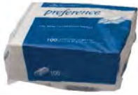
#90800 2PLY DINNER NAPKIN 30/100(43X38c) OPTIMA