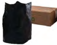
#91095-1 GARBAGE BAG #938 44GAL 100/23x17x46"