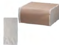
#90888-1 3PLY DINNER NAPKIN ST-377 16/125 (43.2x43.2cm)