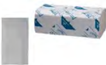
#90474 WIDE HAND TOWEL(20786) 16/250(26 x 24cm)