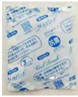
#3857 COOL PUNCH P-50 160/50g/17.5x12x8cmh.