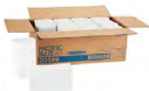
#90478-1 HAND TOWEL(#20389) 16/250(23x23.5cm)