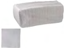
#90879 1PLY BEV. NAPKIN ST-100 8/500(25.4x25.4cm)