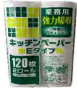
#81083 KITCHEN PAPER E TYPE 12/2/120sheets/27.5x22cm