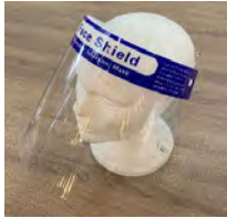
#81647 PLASTIC FACE SHIELD 40/10pcs