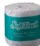
#92942 TOILET TISSUE 2PLY ST-296 2/48(500SHT, 11.4 x 97cm)