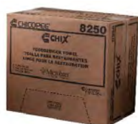
#90480 CHIX FOODSERVICE TOWEL 150(34x60cm) #8250