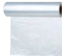
#94016-1 PRODUCE BAG (14") LD 4/150(35x28cm) 12#