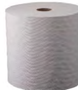
#94069 K-C-ROLL TOWEL(KLEENEX)#1080 12/CS