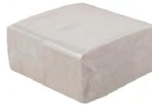
#90887 1PLY DINNER NAPKIN ST-158 20/150(38.1x43.2cm)