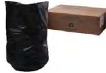
#92694 GARBAGE BAG #0914 15GAL 500/15x9x32"