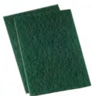
#93656-1 SCRUBBER GREEN (A86) 6/10PCS