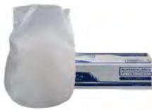
#92702 TRASH LINER 40GAL (14M) 250/40X48" (#1056)