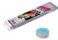
#92416 KOKEI NENRYO 56/30gx5pcs/PK