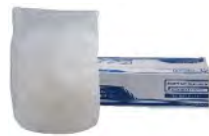
#92703 TRASH LINER 33GAL (11M) 500/33x40"