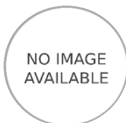
#81136 70% ALC HAND SANITIZER GEL 24/8oz /PUMP BTL