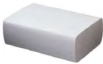
#90473 MULT. FLD HAND TOWEL ST-199 16/250 (24.1 x 23.1cm)