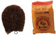
#93647 KAMENOKO TAWASHI SM 12/10 7x9cm