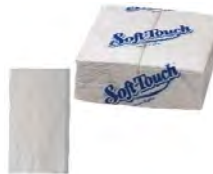
#92806-2 2PLY DINNER NAPKIN ST-257 30/100(38x45cm) w/Pla bag