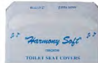
#91008 TOILET SEAT COVER HS20250 20/250 PC