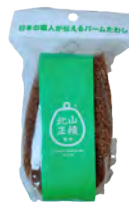
#82691 PALM TAWASHI LG/KMP-02 8/10/1 L/80x140x40mm