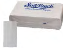
#90886 1PLY DISP. NAPKIN ST-713B 20/500(17.8x33cm)