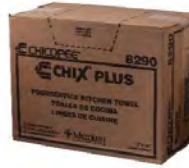
#95412 CHIX PLUS KITCHEN TOWEL 72/33cmx60cm (8290)