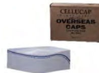
#90805 PAPER CAPS W/BLEU STRIPE 10/100pcs/ 28x8cm