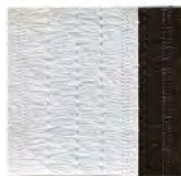
#81925 MEAT/POULTRY PAD TDPP-25 WHITE 2000/3.5x6"