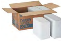
#95728 1/8 FOLD LINEN DINNER NAPKIN 4/100 43.5x41.5cm (92117)