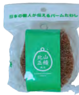
#82690 PALM TAWASHI MD/KMP-01 10/10/1 M/75x100x40mm